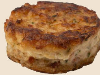
CRABCAKE »» 40 gram