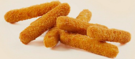
FISHFRIES »» 15 gram