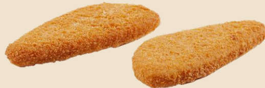
FISHFILET CRUNCHY »» 100 gram