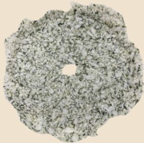
FISHCARPACIO WITH SEAWEED »» 15 gram