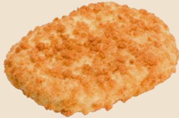
FISHBURGER »» 65 gram