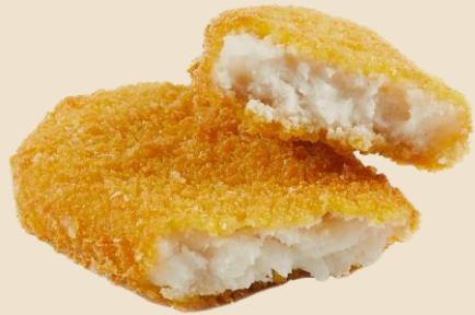
FISHBURGER »» 100 gram